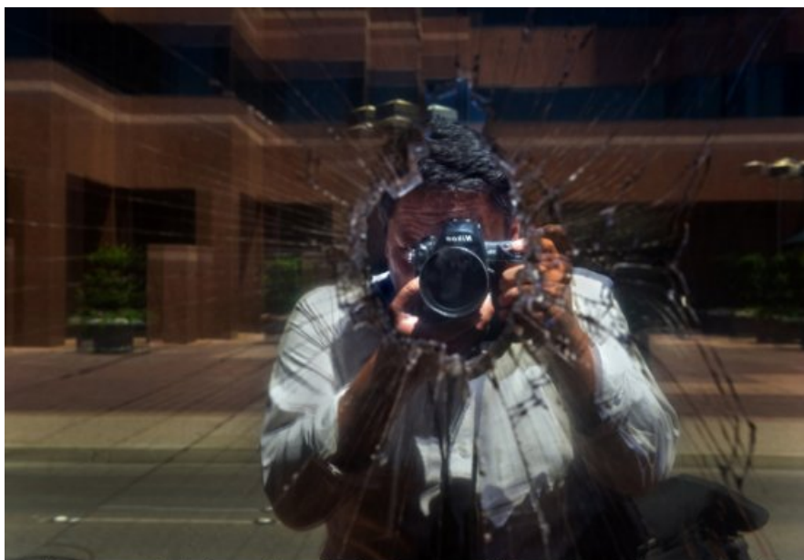
A self-portrait in the broken window on Market Street near California Street in downtown Stockton. (Camera: Nikon D3s. Lens: Nikkor 24-70mm @ 50mm. Exposure: 1/125th sec. @ f/8. ISO: 200).

“Express Yourself! Express Yourself! You don’t never need help from nobody else All you got to do now: Express Yourself!” - Charles Wright